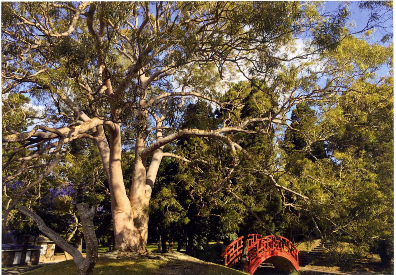
Broughton Hall 2016 Corymbia citriodora, Lemon-scented Gum