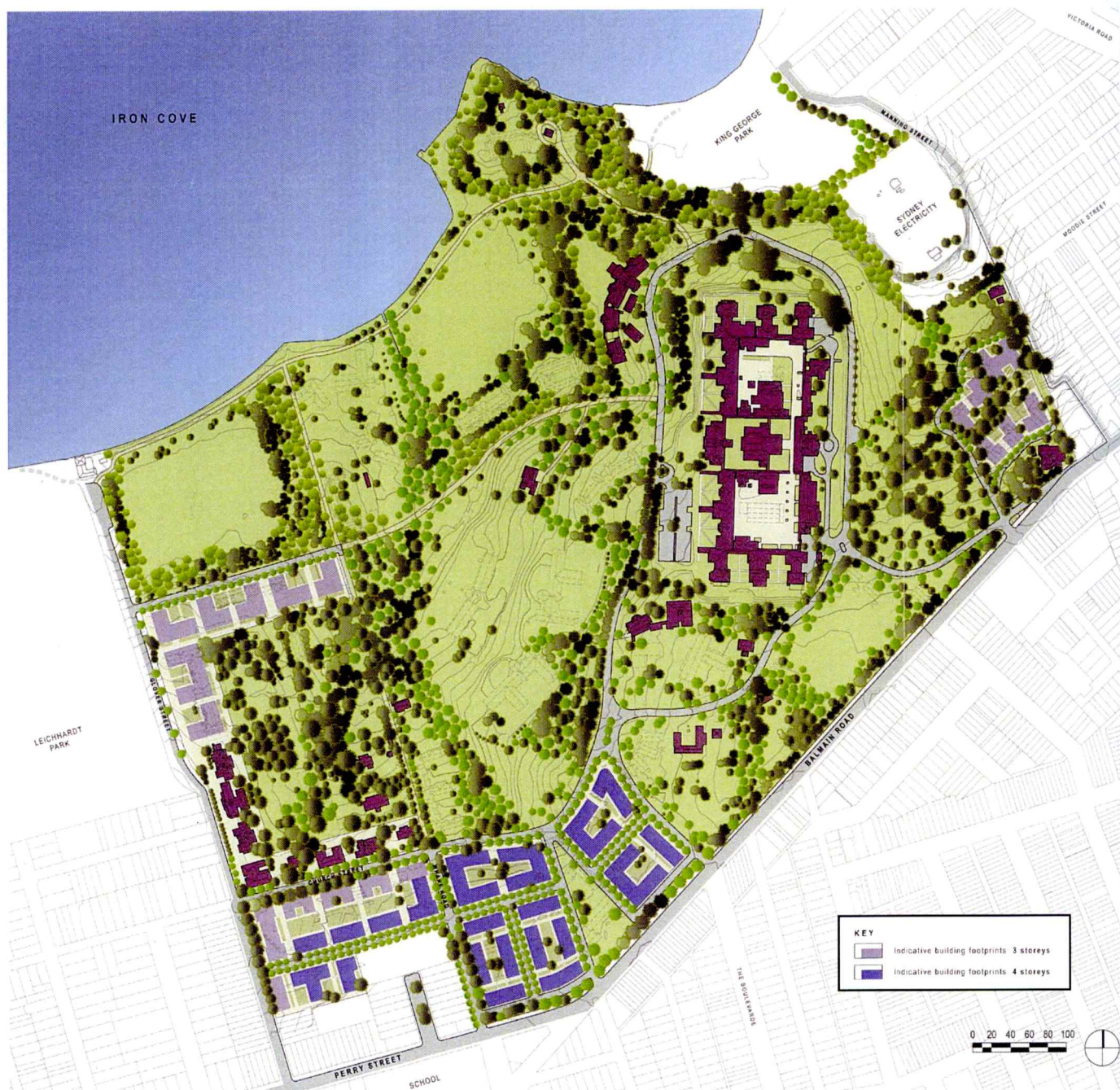
2002 Rozelle Hospital Site Master Plan, p13 – entire site