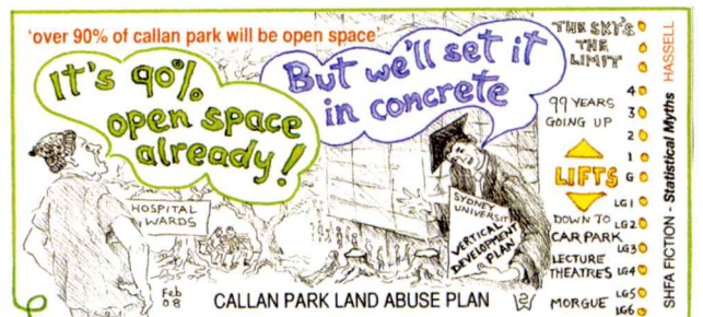
"All Syd's Xmas Come at Once 2007"