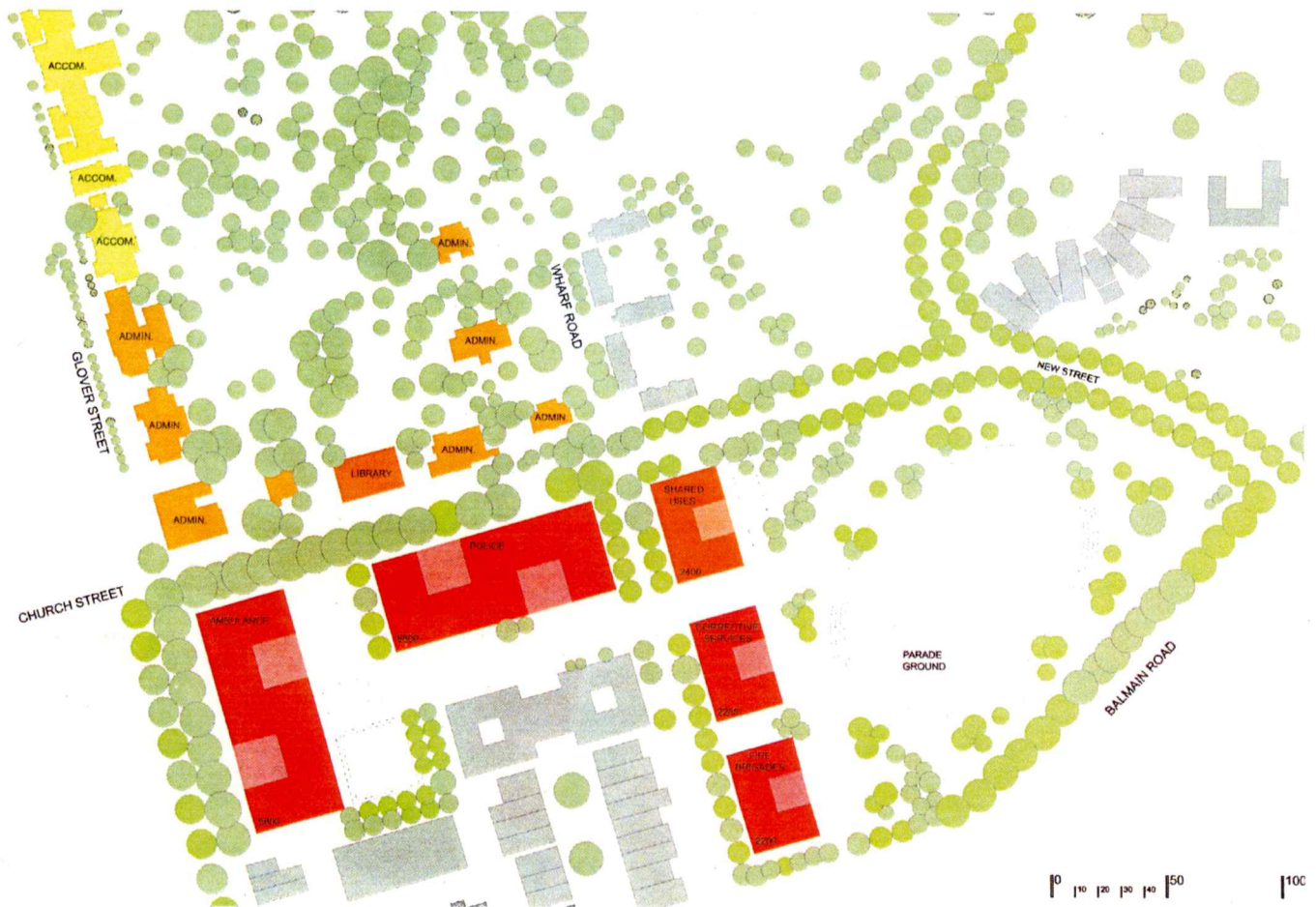
2004 Essential Services Training Academy, Callan Park, Concept Plan, Government Architect's Office, p17.